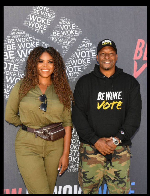
MAYOR CO-FOUNDER AJA BROWN DEON TAYLOR